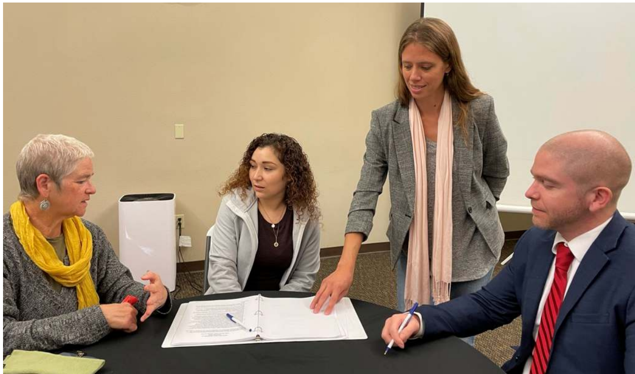
MCL faculty and students participating in a mediation training hosted by MGC.

Mediation is a form of alternative dispute resolution in which a neutral third person helps the parties reach a voluntary resolution of a dispute. Mediation is an informal, confidential, and flexible process in which the mediator helps the parties to understand the interests of everyone involved and explore and work towards options for resolution that may be preferable to litigation.